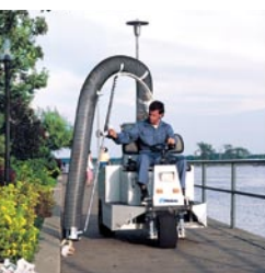
ABOVE Madvac 101 3-Wheel