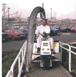
ABOVE Handle tight spots with ease