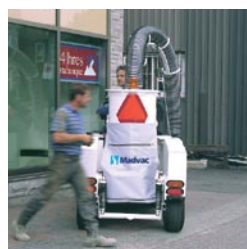
ABOVE Superior rear visibility