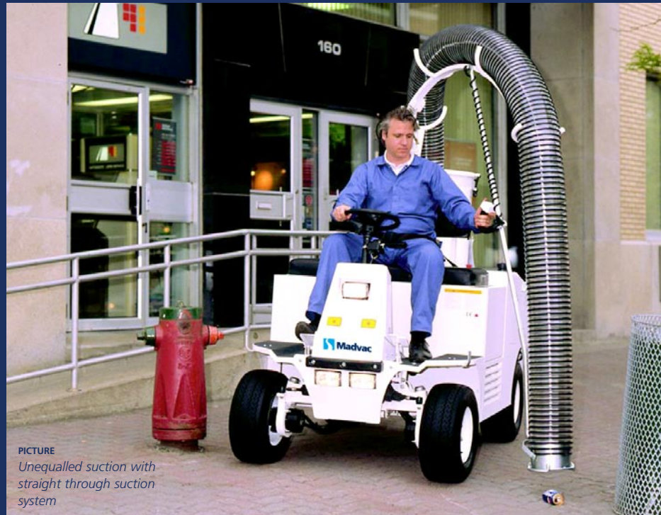
PICTURE Unequalled suction with straight through suction system