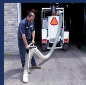
ABOVE 5" x 15' Retractable Wanderhose

Fenceline nozzle elbow ■ Ultraseal tire flatproofing ■ Broom & Rake Holder ■ Fire extinguisher ■ Diesel safety shut-down ■ Emergency stop button ■ Catalytic converter (exhaust purifier)