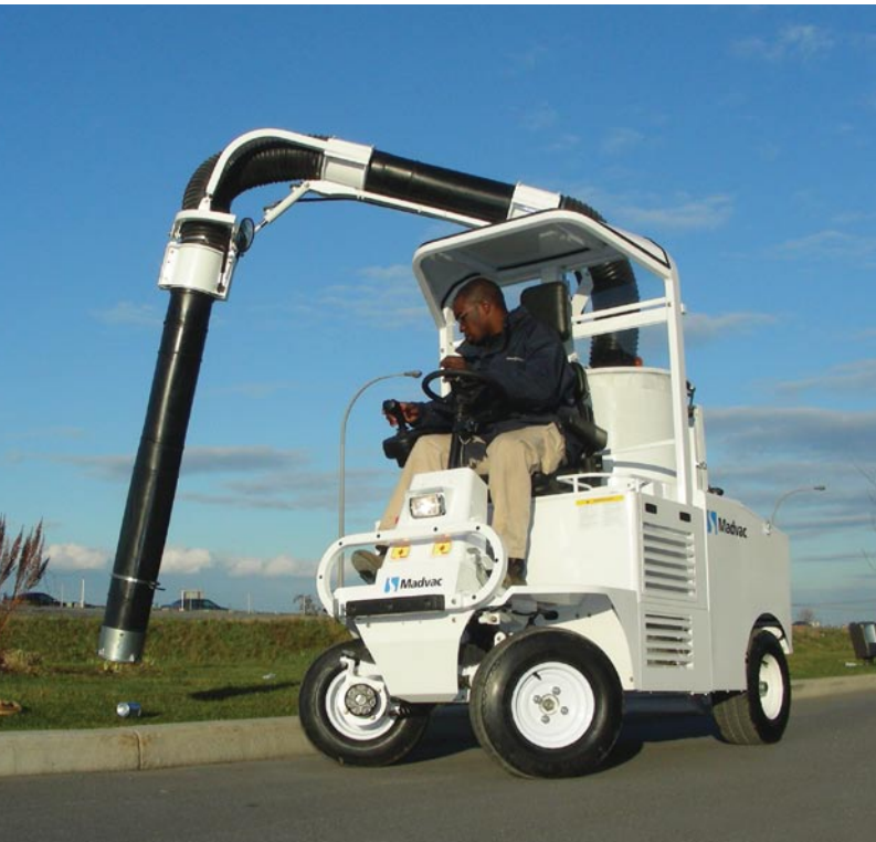
ABOVE New robotic arm controlled via a joystick