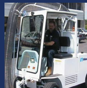
ABOVE Cab enclosure