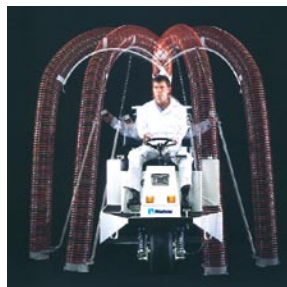
FAR LEFT Access litter on grass covered ground, asphalt or concrete.